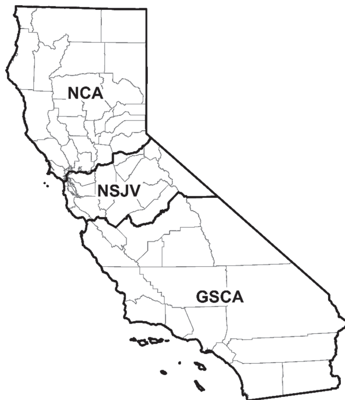
Figure 1. Map of counties in Northern California (NCA), northern San Joaquin Valley (NSJV), and greater Southern California (GSCA) regions for comparison of preweaned calf management practices and bovine respiratory disease prevalence.

The unit of analysis was dairy to estimate prevalence of the different management practices in the 3 dairy regions of California. However, the unit of analysis was calf to estimate prevalence of BRD. In addition, all estimates at the calf level were survey adjusted, where each observation was weighted by the inverse of the sampling fraction ( 1/f_j ) with f_j being the number of calves scored divided by the number of calves on the j th premises. Survey-adjusted prevalence was estimated using proportions for categorical variables and means for continuous variables. Variances were estimated using the jackknife procedure for survey adjusted data. Strata with single sampling units were omitted from